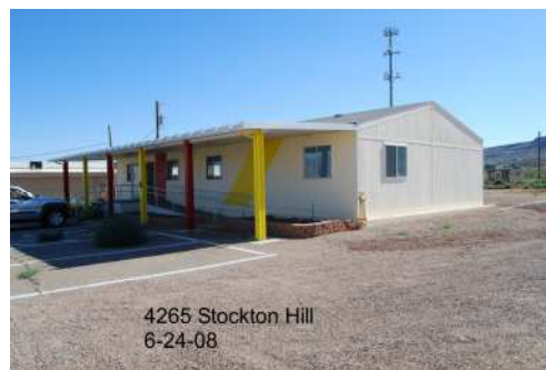
4265 Stockton Hill 6-24-08